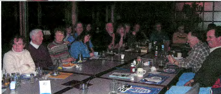
GOOD GROUP SHOWING BAD PICTURE